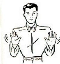
6. PUSHING, CHARGING