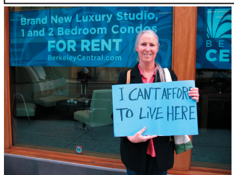
It goes without saying that not everybody can afford the new luxury apartments, so why can't people like this gal just shut up about it already?