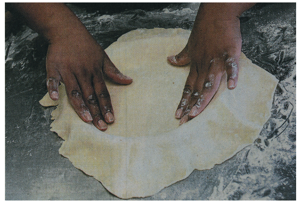
YOU CAN'T DENY that you've been eating it for years.