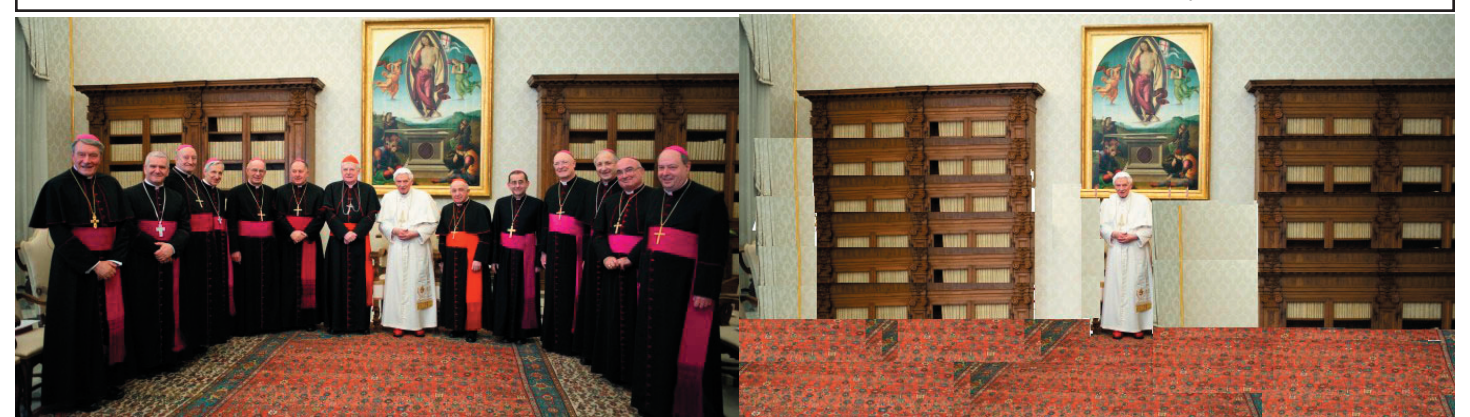
"Okay, now, all of you who are not homosexuals yourselves or who have not participated in the coverup of the sexual molestation of children please step out of the room."