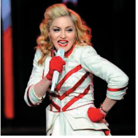
MADONNA HAD A SHOT at being selected for new Pope, but was considered too ethical to get along well with the Vatican staff.

Analysis: Really humble, loves the idea of spreading joy and kindness, loves the idea of sitting around blessing people and giving speeches about compassion. Conclave worried that he was just too radical.