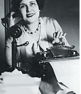
EDITOR Grace Underpressure revels in pure, unadulterated truth.

When the pesky poor people panhandling underneath the Berkeley Central highrise luxury apartments get clonked on the head with a stray wineglass, at least they'll