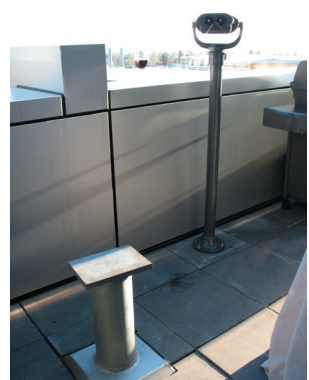
THE BERKELEY CENTRAL luxury apartments are pretty accessible! Except for the penthouse garden's telescope! But oh, well!