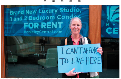
ALMOST EVERYBODY is thrilled with the new luxury apartments except for this disgruntled person who ought to be shot.