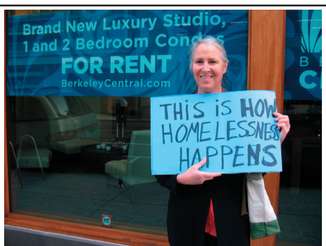
This may be a cynical way to address the housing crisis, but after all, it's a good way to replace our scruffy low-income crowd with a better class of people.