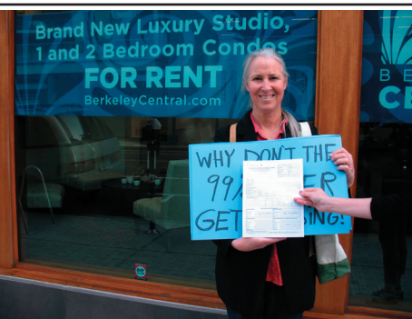
Of course, people like this gal might show up, but it's pretty easy to send out Jessica to threaten to call the police and make sure the management's view is well represented.