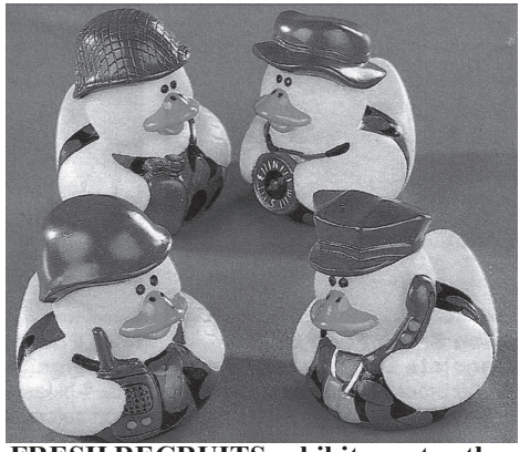
FRESH RECRUITS exhibit great enthusiasm for the war, whether or not they can find it on a map.

In meeting on a street crossing, gentlemen should make way for ladies, and younger per-