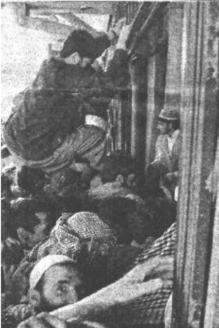
AFGHANIS SCRAMBLE to get in to see "Harry Potter" when theaters opened in Kabul for the first time since 1996.