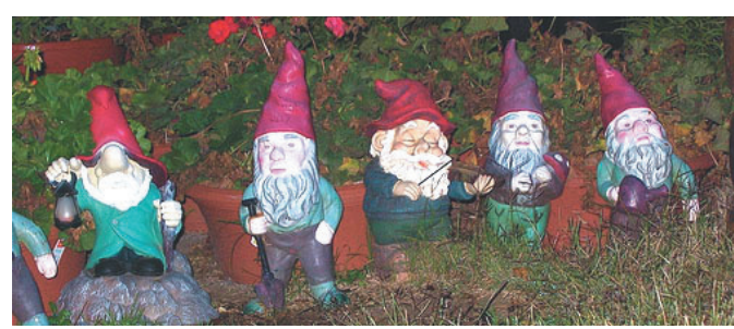
THE ELVES IN SANTA'S WORKSHOP are in fact highly qualified for modern technological challenges and have a proven record of handling global requests and complex distribution which goes back for centuries.

one 24 hour period on Christmas Eve, but