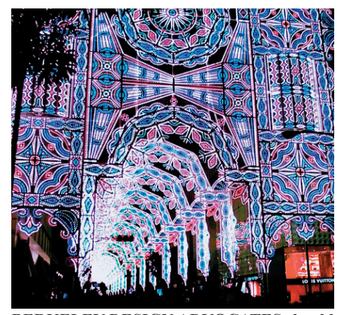
BERKELEY DESIGN ADVOCATES should do a little research before creating their arch design, which other cities really do well.

"It's okay," laughed a local Telegraph shopper. "Whatever they put up there won't be up for long.