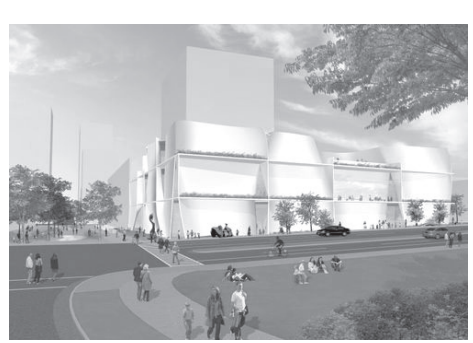
ITO'S DESIGN for the proposed relocated art museum was considered controversial by experts who could never agree as to whether it looked more like tupperware or styrofoam cartons of a Chinese dinner for ten.

be tough politically. But we can sell an art museum, control the land, and then scrap it later. Then we can unveil the tupperware."