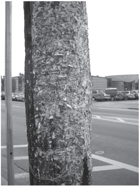
THIS PHONE POLE stapled itself thousands of times in a destructive act of mourning for its close friend, a newsrack that commited suicide after painting itself with grafitti and setting itself on fire in protest of the recent Supreme Court decision on corporate free speech.

"It's a good thing," whispered another Public Works representative who requested confidentiality. "Reading is on the way out, and only serves as a source of litter. And here at City Hall we know that special interest money has its place."