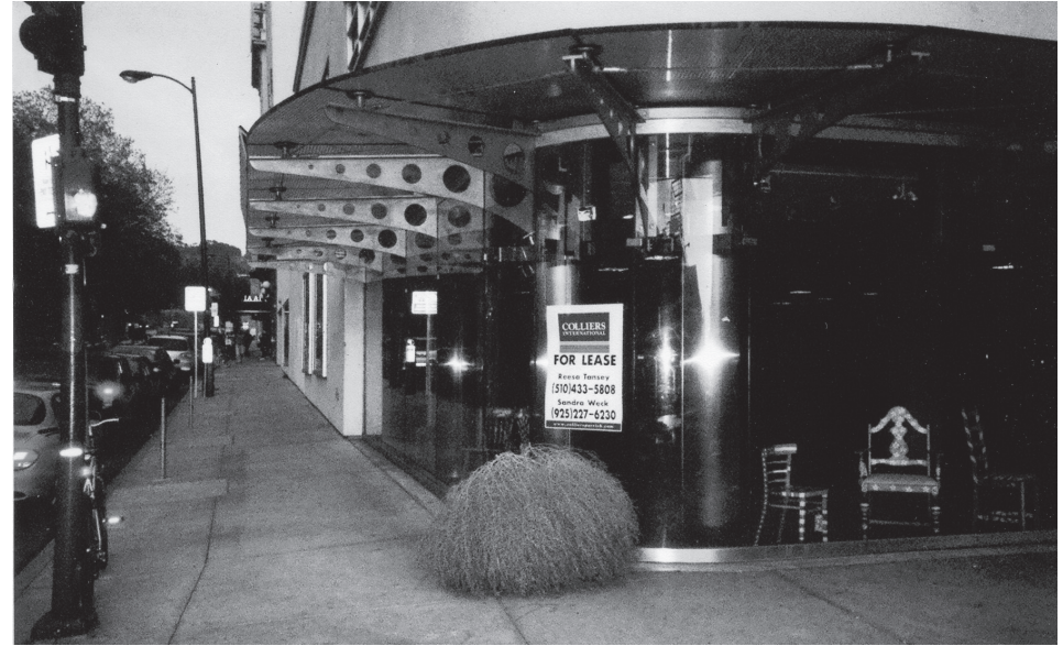
THE TUMBLEWEEDS wandering through the empty streets looking for spare change and hanging around are setting a bad example for vulnerable, impressionable youth and are part of the Economic Development Department's effort to "green" the vacant downtown.

Economic Development Department Claims "Green" Efforts Paying Off