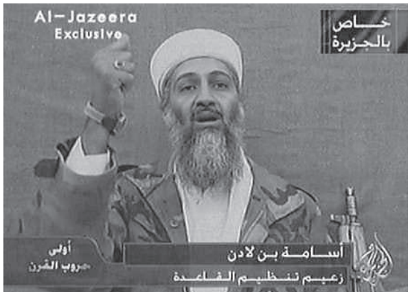
OSAMA BIN LADEN'S NEW "green" message took terrorism analysts by surprise by recommending recycling, bikeriding, and organic hemp clothing.

Experts at the White House and the State Department dismissed the danger of the message catching on world-wide, pointing out that people were still buy-