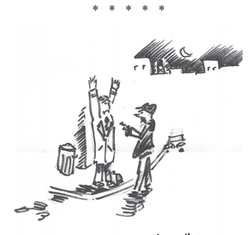
"GIVE ME YOUR JOB."

"This will really make a great weapon in our fight against obesity," state one health advocate. "The Nails Diet is finally bringing some santity back to the dinner table.