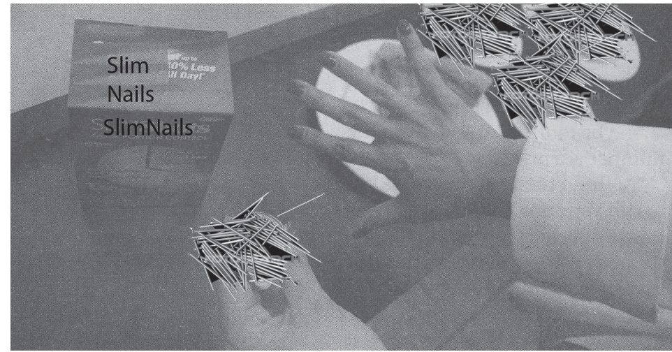
THE NAILS DIET IS GUARANTEED to reduce appetite in 100% of the people who've tried it, producing immediate weight loss.