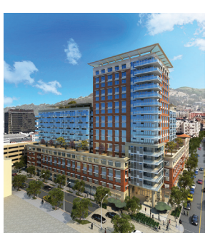
PEOPLE MAY MISS their views but they'll quickly overpass near adapt by learning to enjoy seeing all the people in these "People get windows enjoying the view

"It's a matter of community pride," offered another freeway overpass camper. "We need to embrace developers' needs and make them feel welcome.'