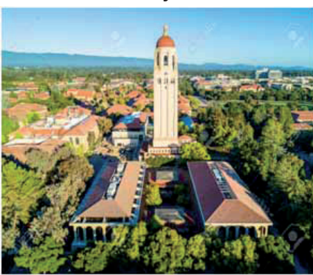
THE HOOVER INSTITUTE INSISTS that this physical profile of the Institute references an Egyptian Sphinx, not that other thing.

quite excited that Atlas had worked so near the levers of power in the US government and that this caused them to consider the historic implications of a potential name change. President Hoover, the current namesake, was able to promote their values