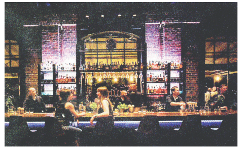
NAPA'S LUXURY RESTAURANTS are doing a bustling business if they didn't burn down.

"Conflicts of interest, abuse of office at the highest levels, weak oversight, all represent a retreat from democratic norms," affirmed the Berlin -based group of scientists. "Fortunately it appears to make no difference to those who can afford the $360 tasting menu."