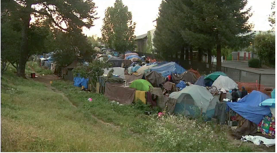
JUDGE SUSAN VAN KEULEN STATED THAT THE "BALANCE OF HARDSHIP tips in favor of the Plaintiffs" in a Santa Cruz court case protecting tent dwellers from sweeps, clearly miscalculating the severe aesthetic hardship for others who just can't bear to confront economic inequity.