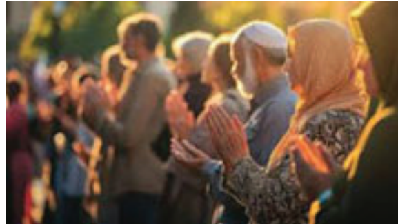
AMERICANS GATHER TOGETHER to pray that some other country takes over theirs since clearly that's the last hope of having some sanity at the helm of the nation.

"They're probably not scared of the military," mused a young American with folded hands listening to the quiet singing. "But