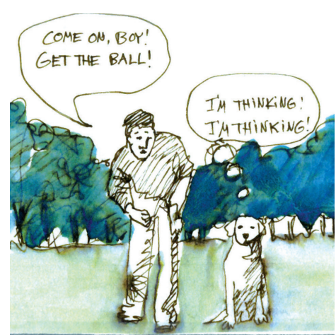
REPORTERS TEND TO RUN STRAIGHT FOR THE BALL while dogs take their time weighing the possible consequences of what might turn out to be an intellectual distraction.