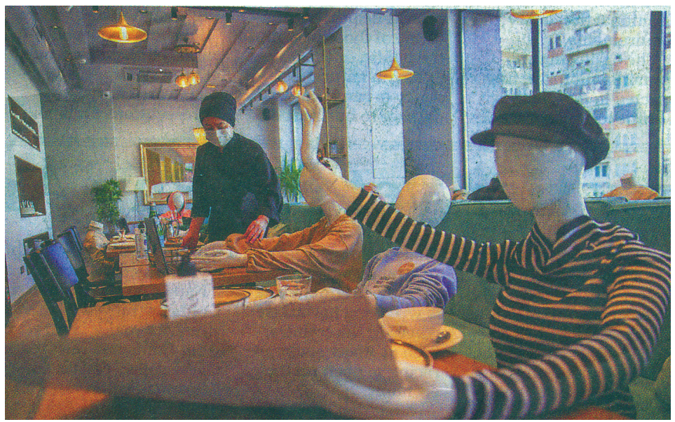
PEOPLE ATTEMPTING TO REJOIN PUBLIC LIFE are stiff and awkward, say inappropriate things, and find themselves unable to make simple conversation, which is not the worst of it say waitstaff, airline stewards, bus drivers, and others weathering the perilous pandemic comeback.