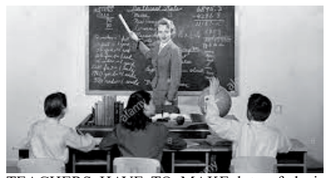
TEACHERS HAVE TO MAKE lots of decisions about how to present controversial material to young, impressionable minds.