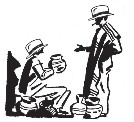
ISSUING STANDARD FEDORAS to Mexicans will help bring both cultures together so they can share a margarita.