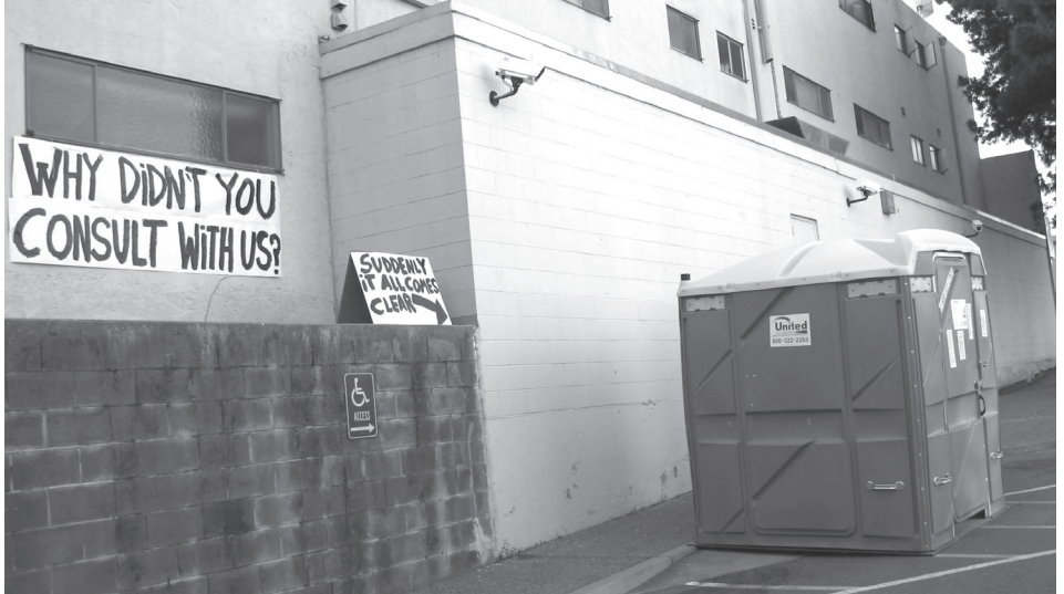
WHO WOULDN'T ENJOY this exclusive proximity to the stylish facilities provided by the West Berkeley "Neighborhood" Development Corporation's celebratory con-tribution? Some people just get lucky.