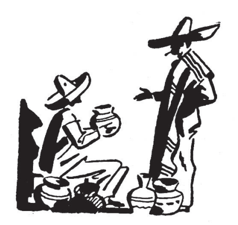
THE SENATE KNOWS that Americans feel insecure about their identity, so that even sombreros can seem threatening.

The Pepper Spray Times gratefully accepts donations, death threats, mailing list additions, etc., at: