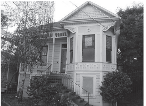
THIS INFLEXIBLE BUILDING would have made a really useful 7-Eleven.

Small, short-sighted bands of landmark-lovers oppose the proposed legislation, whining that history will somehow suffer without the actual presence of the rotting carcasses of these onceuseful buildings. This group has left an actual mark on the landscape by craft-