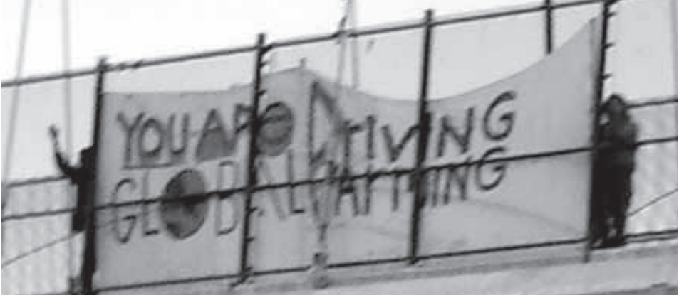
SOME PEOPLE JUST don't appreciate that some of us are too busy to take public transit and have lots of errands and need our privacy and stuff.

Have your parcels sent and so avoid the fatigue of carrying them.