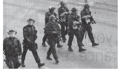
THE LAPD"s Morris team sported a new look this year which included new and creative uses of the traditional sticks.

LOCAL L.A. MORRIS TROUPE RUNS AMOK ON MAY DAY