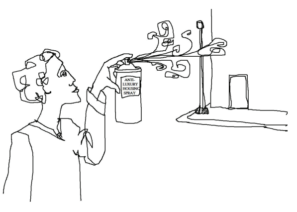
BE SURE TO PICK UP A HANDY CAN OF luxury housing spray to keep developers out of your neighborhood.

This may not look immediately dangerous, but if you need the phone for an emergency you don't want to find out the hard way that your blanket has enjoyed taking a lengthy push-poll.