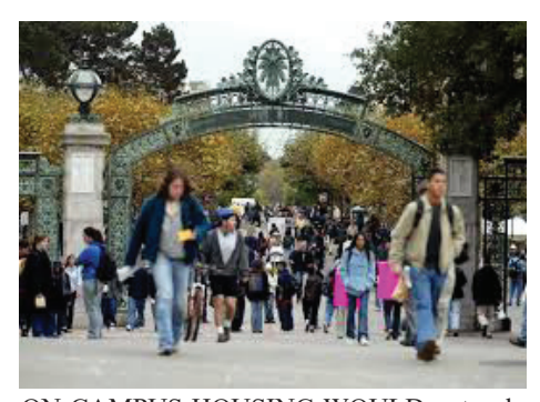
ON-CAMPUS HOUSING WOULD not only be a pastoral experience, it would reduce the wear and tear on students trying to get to and from a campus with no parking whatsoever except somewhere in Fresno.

And that's not all! The Chancellor's Esplanade is a green expanse between Tolman Hall and the chancellor's residence "shaded