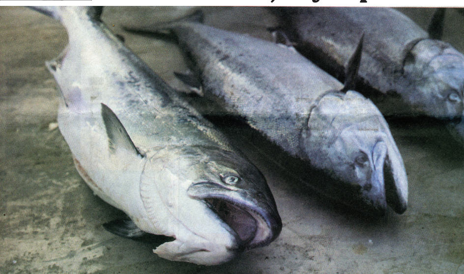
THESE VOTERS MIGHT BE EXCITED ABOUT THEIR OPTIONS in the upcoming election or they might be trying to figure out what to cook for dinner or they might be dead, say experts who have studied them for years and still can't tell.

Voters' Excitement Difficult to Measure, Say Experts