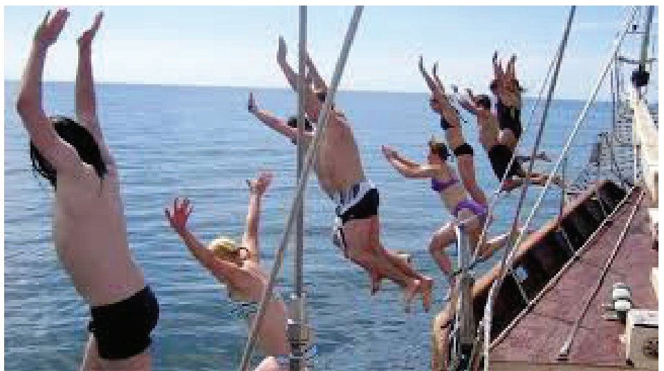
CITY OF BERKELEY EMPLOYEES ARE SEEN HERE JUMPING ship at an alarming rate and nobody really seems to know why.