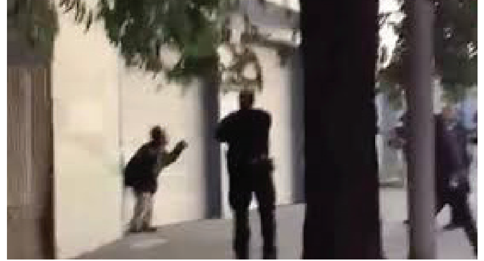
THE SHOOTING OF MARIO WOODS showed that police can kill people who are just walking along the street and for heavens sake sometimes they need to do just that.