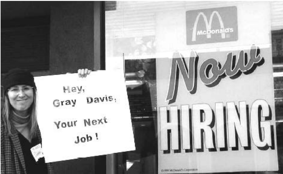
THE GOVERNOR GRAY (“SPARKY”) DAVIS Employment Assistance Outreach Committee is working overtime to make sure his wisdom and talents do not go to waste in the current economic downturn.