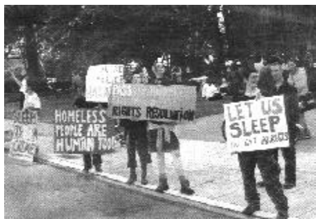
THESE PEOPLE just can't seem to get to sleep and just won't stop whining about it.

Homeless people and human rights activists packed the Berkeley City Council chambers recently and successfully argued to a divided Council that arresting people for sleeping outside should be the police's lowest priority.