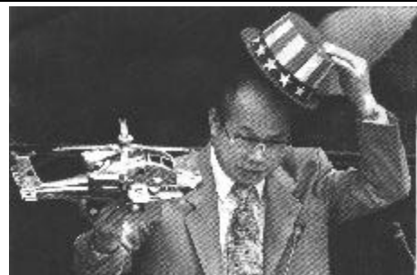
THE DARK ENERGY currently controlling the universe explains a lot of really weird stuff going on like this guy .

Fax freely, plagiarize wildly, in other words, enjoy.