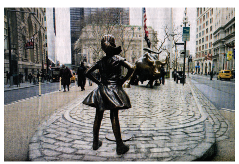
FEARLESS GIRL JUST WON'T go away and is spoiling the whole effect of the fearless bull at the other end of the sidewalk.