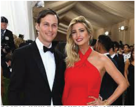
POSING WHILE LOOKING WEALTHY is a misunderstood part of the President's family's job and is a lot harder than it looks.

"I drew that from my experience in the private sector," stated Kushner with gravity. "I sought and received input from myself and after great discussion we are in agreement to use those really great folder things with the slide-on binders.