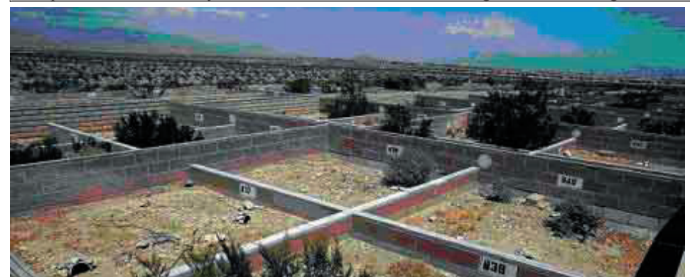
DEVELOPERS WHO ARE NOT STRONG ENOUGH to survive desert sanctuary conditions will be euthanized unless the Conservation Center can find compassionate communities who want to care for them.