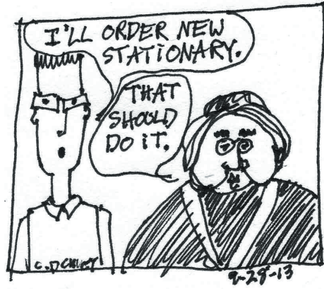
Next Issue: Setting fire to charter schools with celebrities!

From: Pepper Spray Times 1970 San Pablo Ave. #4 Berkeley, CA 94702 cdenney@igc.org www.caroldenney.com