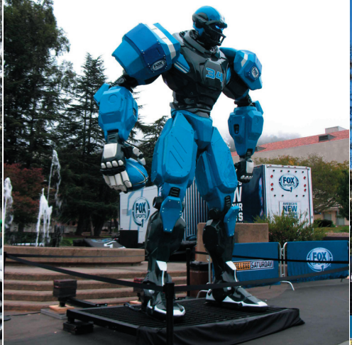
HE WAS MARRIED ONCE, BUT accidentally killed his wife by giving her a hug. He turned to the art world and campus sports in an effort to keep busy without knitting.