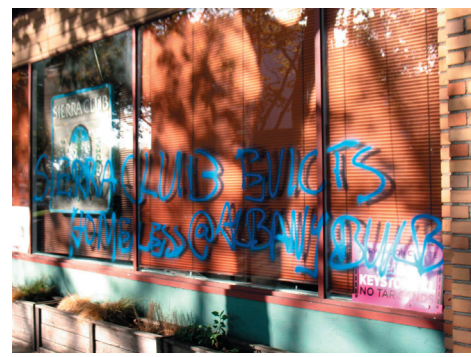
PEOPLE ARE REALLY ANNOYED that the local Sierra Club apparently doesn't think homeless people are as cute as owls and frogs and condors.

'Anytime they need help, they can just ask," offered one local workshop crasher who discouraged reporters from calling the alternative workshop strategy a counter-demonstration. "We initially called it 'Charted for Decades, You Self-Involved Idiots,' but realized that sent the wrong message," she stated while brushing off the glitter from the "Robots Suck: Pipecleaners Are More Fun And More Useful" workshop which drew a capacity crowd.