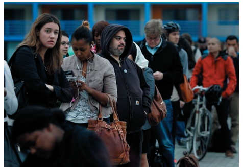
CARPOOL RIDERS CAN FINALLY give sigh of relief that they don't have to think about labor issues anymore and can play games on their phones.