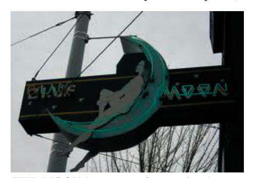
THE MOON has ways of capturing human imagination and might be the only thing that can distract the public from focusing on climate change and leaving NASA in the dust.

"It's true it's not really an atmosphere,"