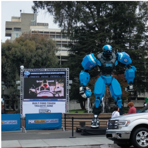
THE NEW FOOTBALL ACTION FIGURE once at the southeast corner of the UC campus is the kind of public art that always has the usual detractors who just don't get it.