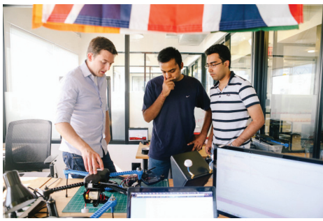
THE WE WORK GUYS have trouble figuring out how to justify their venture capitalization but if they stare long enough at the mannequins in bridesmaid dresses it will come to them.