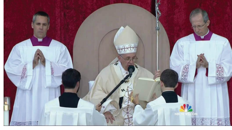
THE POPE CAN CANONIZE ANYBODY he wants to so there.

The ninety percent death rate for native people was pretty serious," noted one historian. "But that last ten percent was a sturdy bunch."