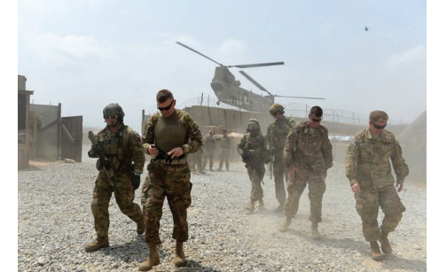
AFTER FOURTEEN YEARS of war the theory is that we may be in a hole but we might as well just keep digging.

"We need blight," explained another planner frankly. "We're thinking of hiring graffiti artists to help.'