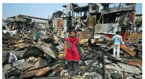
MANY COUNTRIES HAVE aolved the problem of low-cost housing for poor people.