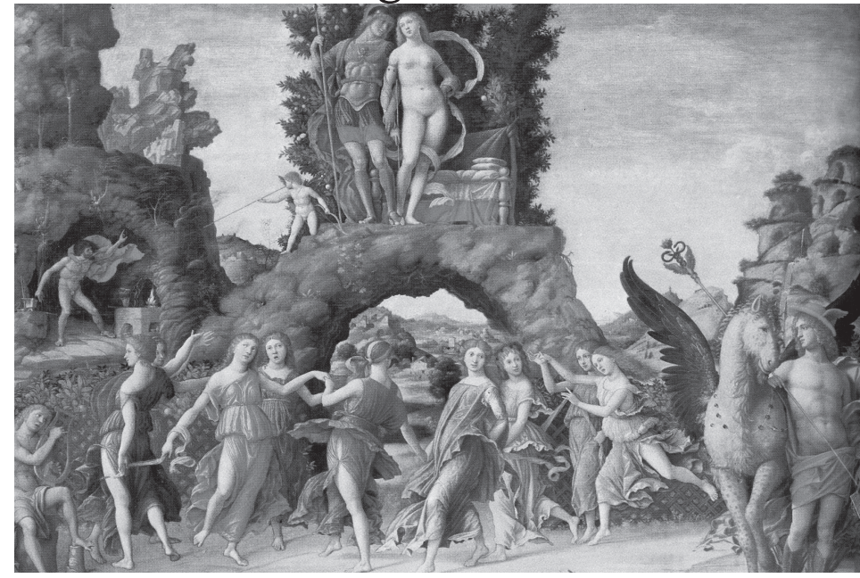
THERE ARE AT LEAST 458 CRIMINAL VIOLATIONS in this picture of people cavorting in People's Park, which is the obvious source of all crime in Berkeley.

Annual People's Park Crime Wave Arrives Right on Schedule