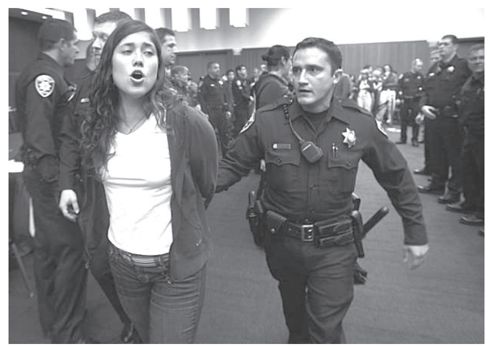
A 32% FEE INCREASE PLUS NEARLY 2,000 LAYOFFS AND FORCED UNPAID FURLOUGHS are for some peculiar reason unacceptable to thousands of affected students and workers, who took advantage of a brief moment of nation-wide incivility to disrupt a recent regents' meeting rather than study and quietly hand over their money.

Ask Lena for advice about delicate zoning issues at cdenney@igc.org.