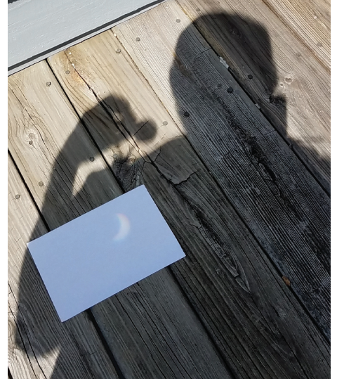
IF YOU LOOK CAREFULLY you can see the edgy, disruptive new banjo eclipse safely projected on a piece of paper which won't require a lot of camping equipment or hurt your eyes.