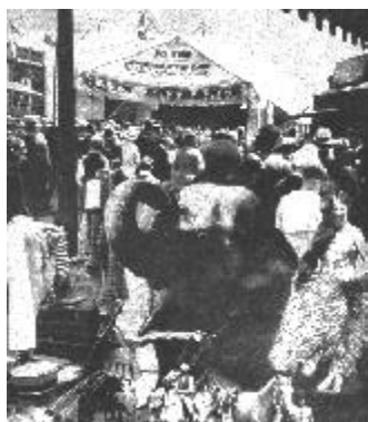
UC students seem delighted with UC Berkeley's new look, which maximizes parallels to the magic of the circus.

UC officials pointed out that spending large sums of public money on management, security, and image consultants was nothing new for the University of California, and that anyone who'd been watching the news would appreciate that it has been a particularly difficult summer.