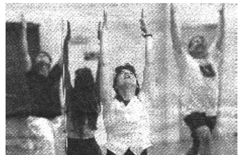
OAKLAND MAYOR JERRY BROWN will host free new age classes at his mindfully centered live-work warehouse.

The Pepper Spray Times gratefully accepts donations, death threats, mailing list additions etc., at: Pepper Spray Times 1970 San Pablo Ave #4 Berkeley, CA 94702 cdenney@igc.org www.caroldenney.com