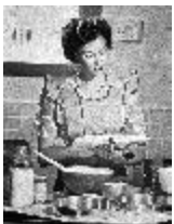
DBA NUTRITION experts researching the hunger problem.

Merchants who complained for years about rampaging mobs of high school students overwhelming their businesses at high noon are changing their approach, deciding to offer food on campus.